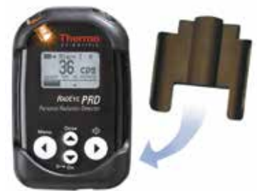
Our Lutetium test adaptor ensures quick and reliable performance verification

The RadEye SPRD offers the next generation of NBR. The added fidelity of the new multi-channel NBR algorithm provides higher sensitivity to positively differentiate between natural and man-made radiation during search and find operation and better detection performance against masked isotopes. Once an alarm indicates the presence of significant gamma radiation the RadEye SPRD can automatically switch into radionuclide identification mode for immediate analysis. The editable trigger list allows users to select nuclides of concern from a list that includes all in the ANSI N42.48 standard. Users may also define custom subsets based on their areas of interest such as medical or industrial applications.